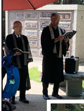
Above: Temple Hill Cemetery, Raymond, July 9 Left & below: Mountain View Cemetery, and Obon service at BTSA, Lethbridge, July 16