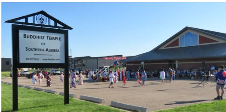
BTSA parking lot became bon odori space