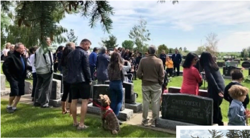
July 3 - Rosemary/Brooks