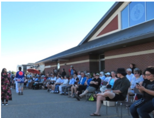
Onlookers comfortable in shaded area

Although limited by the temple board to the parking lot due to the continuing pandemic, the event still included the sale of food items, trinkets and Buddhist memorabilia. Included were taiko demonstration and group singing during a break.