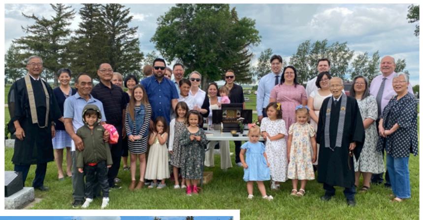
July 10 - Magrath