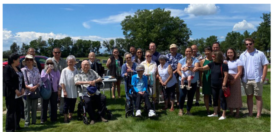
July 10 - Taber