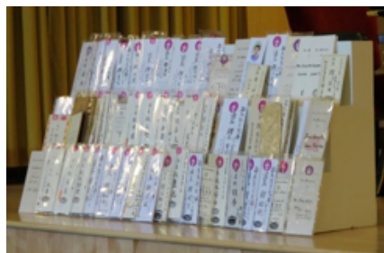
A display of Buddhist name cards (homyo).

The large gathering was completed with a catered meal, assisted by members of Toban 2.