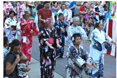
Tanko Bushi dancers and crowd joining in the last dance.