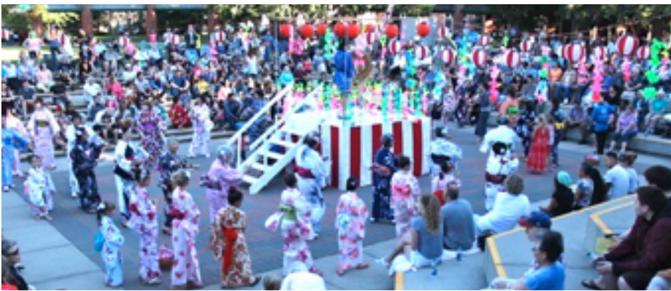
Dancers begin the bon odori.