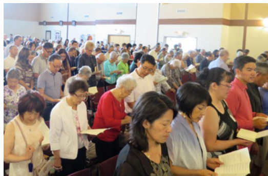
Part of the large Obon congregation.