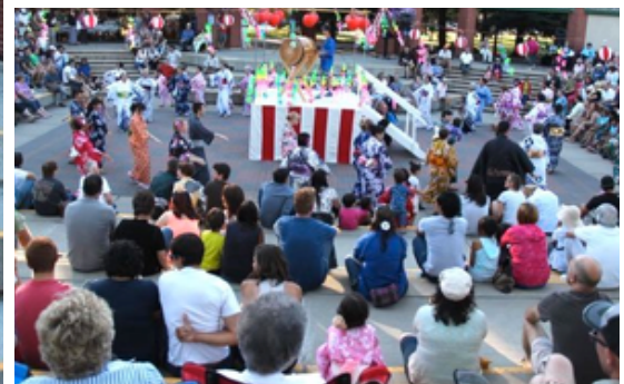
Left: Dancers assembled after the event. Above: Crowd watching dancers.