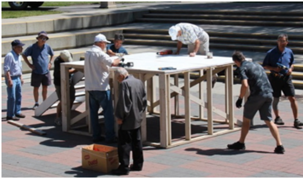
Setting up the stage (yagura).