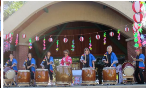
Taiko call to assemble.