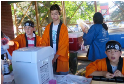
Youth selling shaved ice (kori).