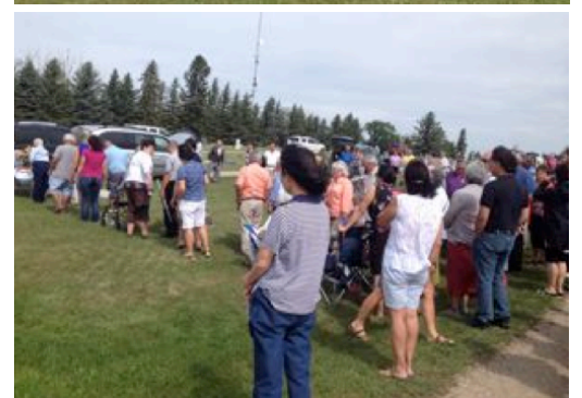
Taber, July 25