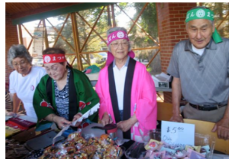
BTSA Craft Sales Table.