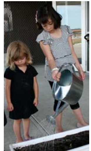
Planting at the temple gardens