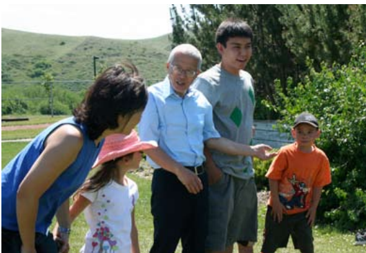
Annual BTSa Service & Picnic, June 2009