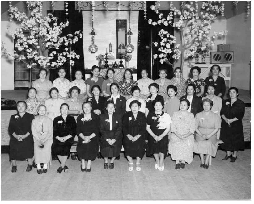
Taber Buddhist Church Fujin-kai Members, c. 1953

The Museum will open a small exhibition of artifacts original to the Church's 1940-era founding on November 28, 2009 at 10:00 a.m.. As part of the opening, Reverend Izumi of the BTSA will provide a blessing with a reception to follow. All members of the Temple are invited to attend.