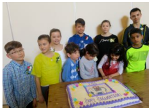
Birthday cake for Buddha