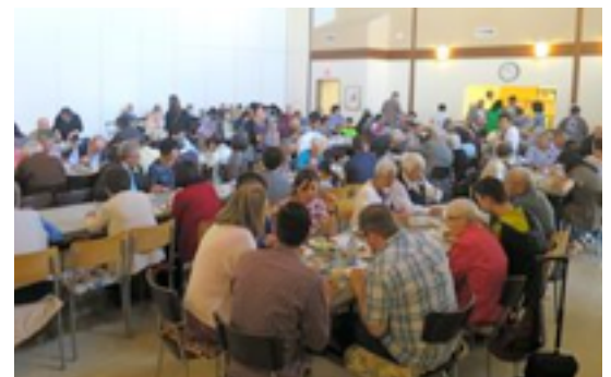
Attendees enjoying supper