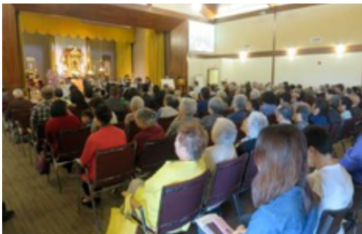
Listening to the choir