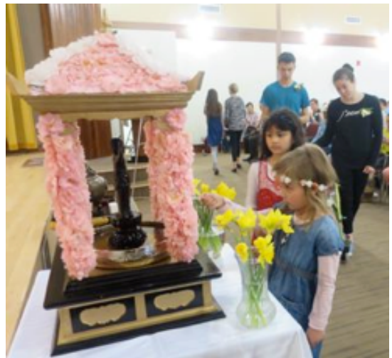
Children at the hanamido.