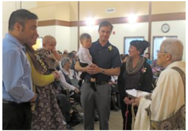
Infant presentation ceremony

The day's festivities were capped with a reception/meal at which time "Happy Birthday" was sung by a cake prepared for the occasion.