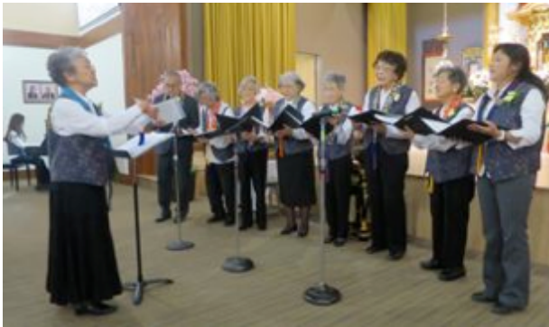
The choir performs three numbers