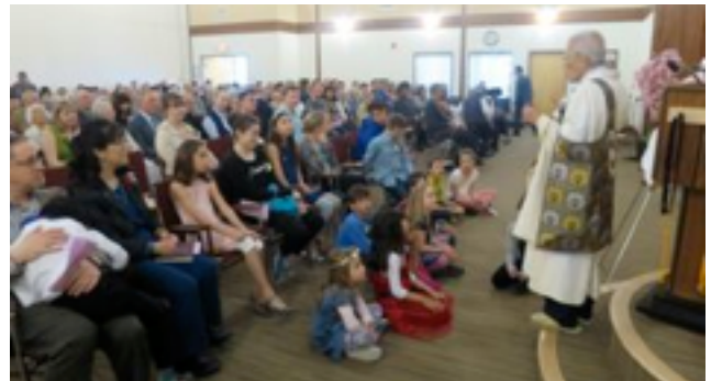
Sensei speaks to the children