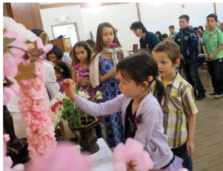
Children at the hanamido, pouring sweet tea over the statue of the baby Buddha