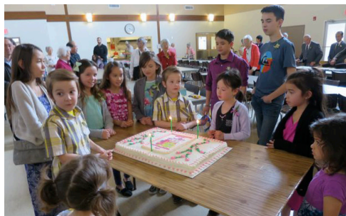
Children singing Happy Birthday to the Buddha.