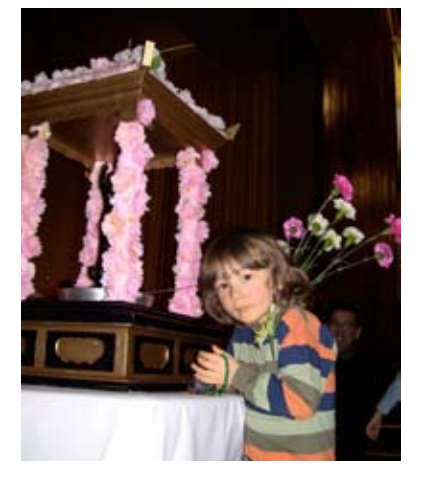
Hanamatsuri: pouring sweet tea over the baby Buddha and celebrating with birthday cakes.