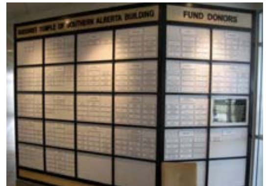
The donor wall dedication plaque is shown on the far right window in black. Its text can be found on page 8 of this Hikari.