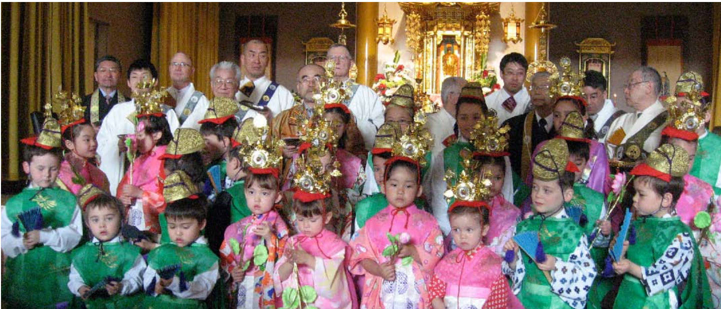
OCHIGO PARADE Temple Dedication Service Sunday, April 26, 2009