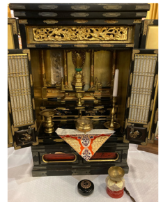
Additional images from the Butsudan workshop.