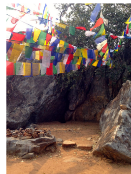
Possibly the cave on Vultures Peak where the Buddha stayed during his rain retreats. This is where he gave the Lotus Sutra.