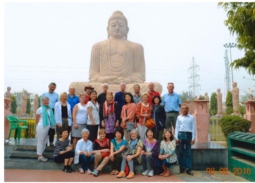
In front of Daibutsu, Bodhgaya