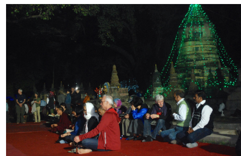
Time for reflection under the Mahabodhi Tree