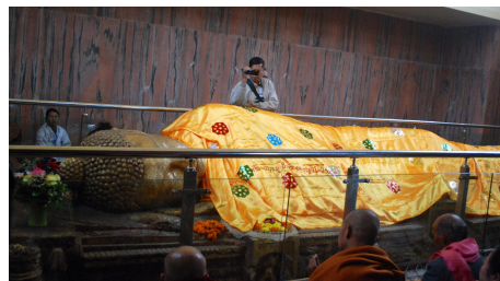
22' reclining Buddha in Mahaparinirvana Temple, Kushinagar