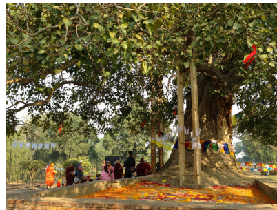
Anandbodhi tree in Sravasti which is a descendent of the Mahabodhi Tree in Bodhgaya.