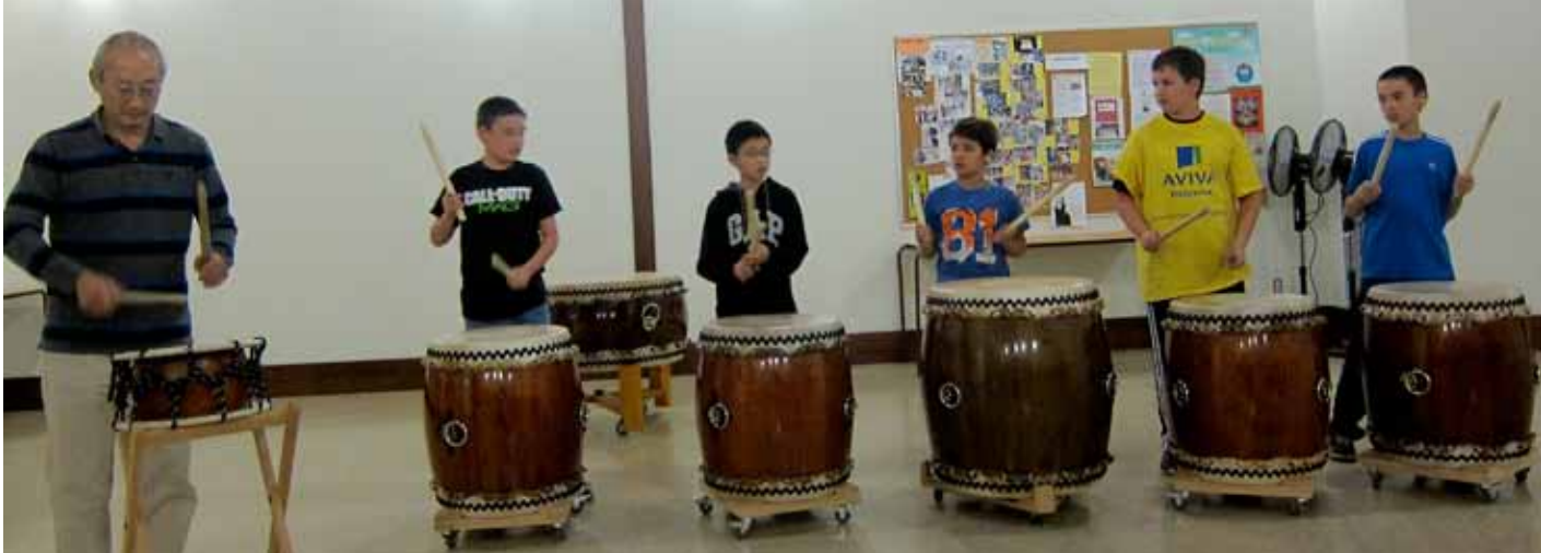
Junior Minyo Dancing and Taiko are two of the activites that the temple hosts.