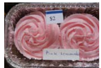
Community Bake Sale to benefit the BTSA Japan Disaster Relief Fund