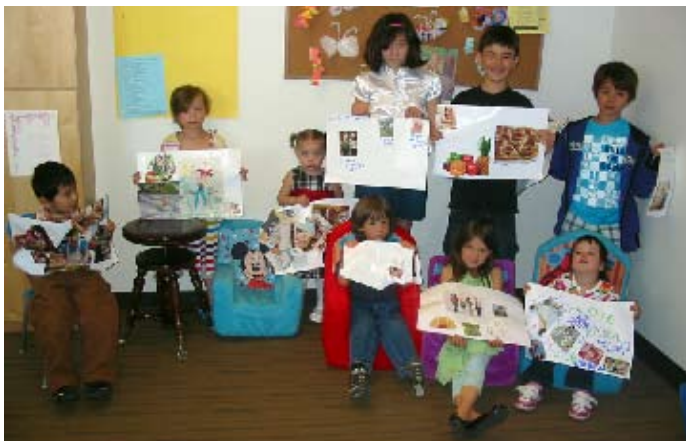
May 29 the Temple celebrated Parents' Day with a delicious lunch. The students made collages about gratitude and family, and handed out magnets to show their appreciation.