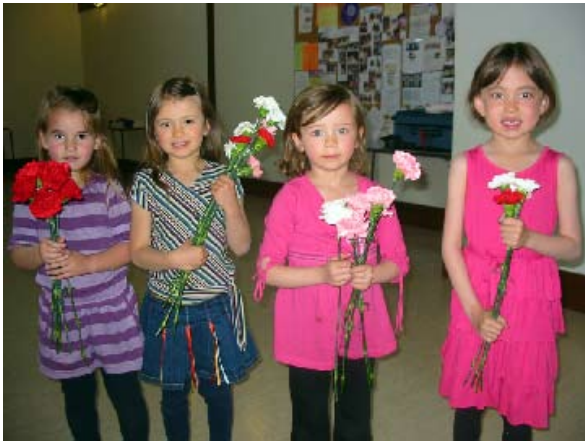
May 8, Mother's Day: The Dharma students handed out carnations.