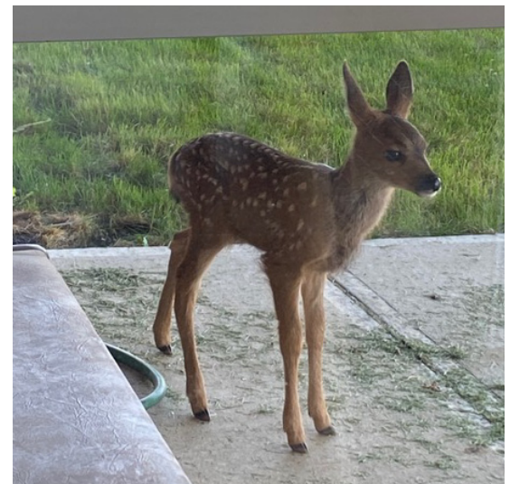
More images of mother and fawn seen at the temple.