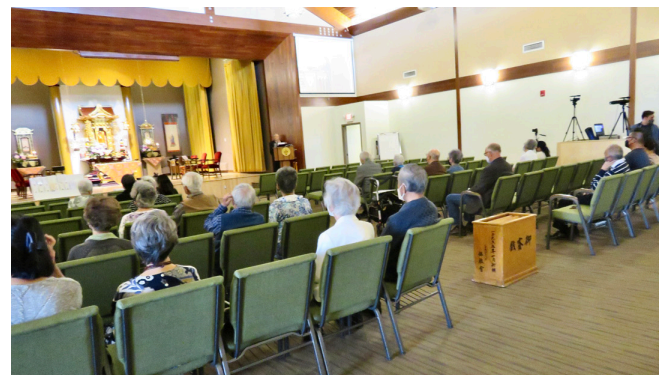
Listening to sensei's dharma talk, printed here

How joyous I am, my heart and mind being rooted in the Buddha- ground of Amida's universal vow! — Shinran