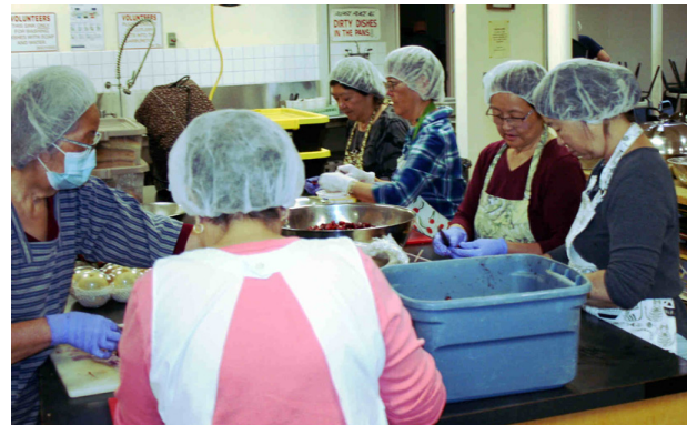
Cutting ingredients for salad and chili