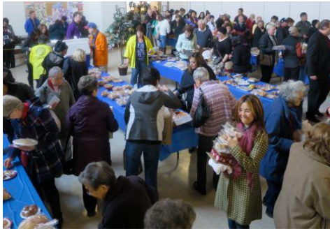
The steady stream of customers reduced elbow room as tables were bereft of goods.