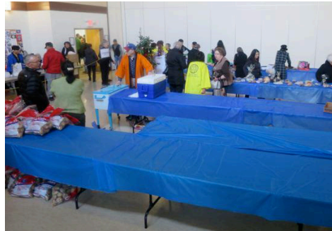
Only 40 minutes passed before most of the baking, noodles, and bento were gone.