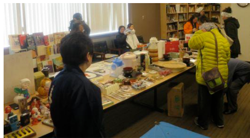
...and the hondo