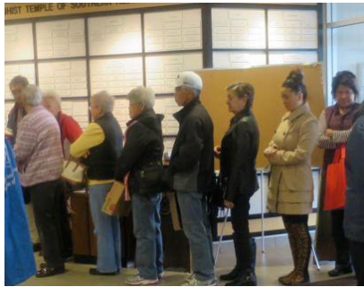
Meanwhile, the customers began lining up outside and in the foyer.