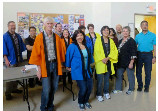
Some of the many members and friends who volunteered to make the sale a resounding success. Thanks to All.