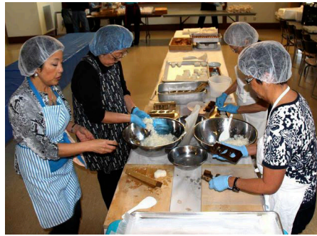
Inside, last-minute preparations like putting together a bento lunch were going on before the sale.