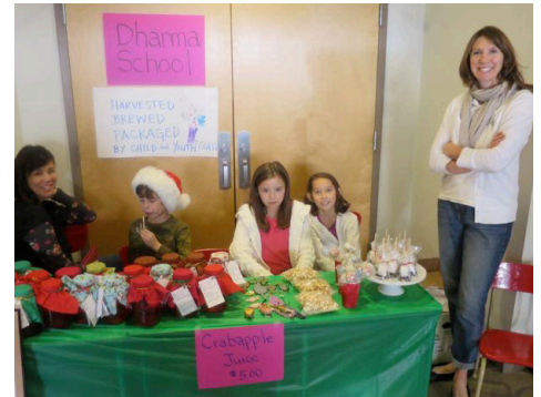
The Dharma class had a table in the foyer.