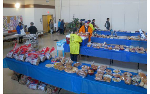
The doors are opened and the first customers enter to check out the goods.