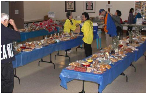
Donated bake goods also were being displayed nicely on tables.