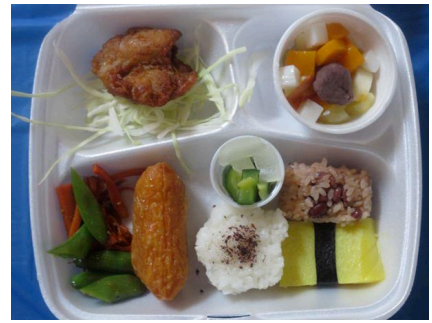
Many hands had a part in putting the different parts of the bento together...