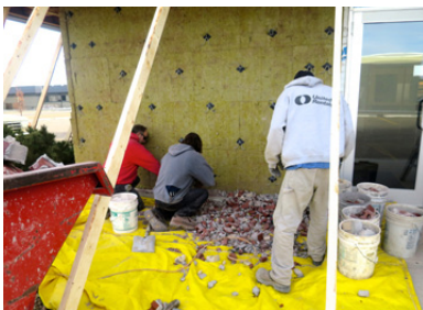
Bricks off back