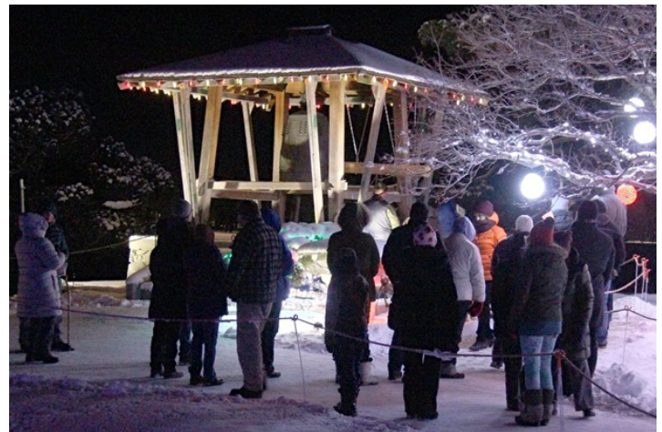
Line Up to Ring Nikka Yuko Bell