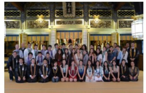
Meeting Dharma Friends from Hawaii, Buddhist Churches of America, South America, and Japan!