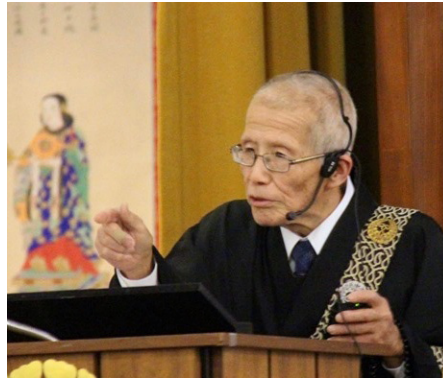
Intro of Guest