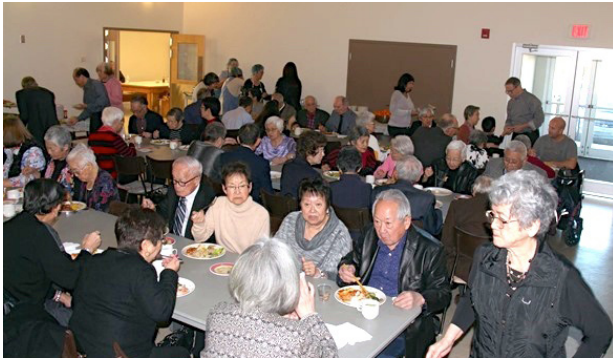
New Year's attendees