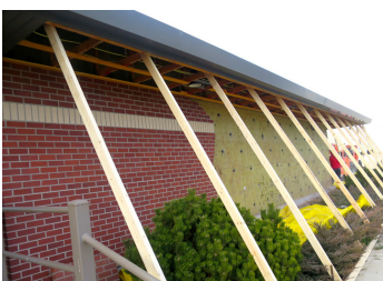
Bricks off side