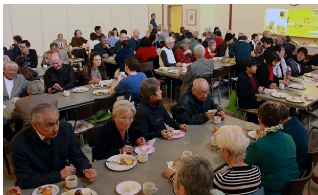
Large numbers enjoying supper