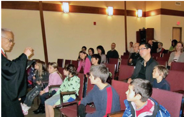
Sensei speaking to the children