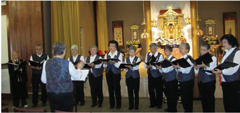
The BTSA choir during the service