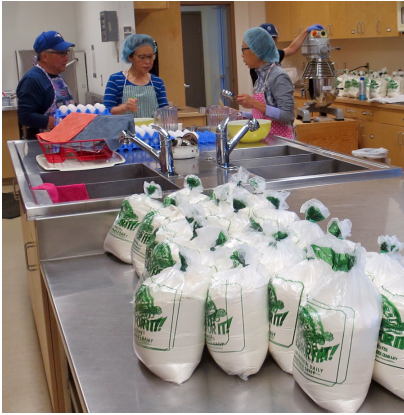
Bags of Mixed Flour