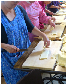
Small dough strips