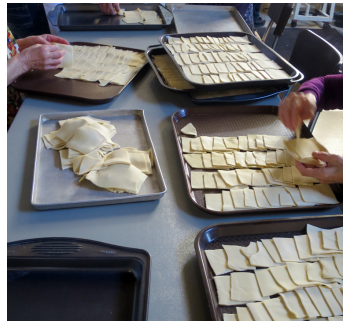
Ready for cutter