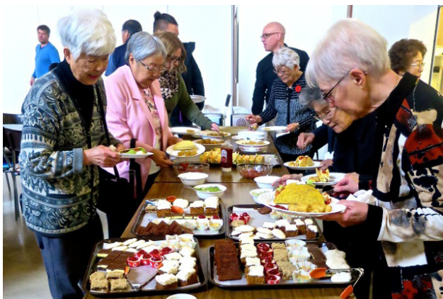
Tacos and other goodies were enjoyed after November Monthly Memorial