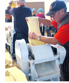
Press No. 3