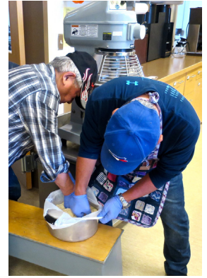
Compacting dough into cake

Mein-making Saturday began at 8 am Nov. 16, with a great turnout of members and Dharma friends. The job was completed by mid-afternoon, thanks to outstanding efforts. Thanks to everyone who worked so diligently to make valued mein noodles preparatory to the Bodhi Bake Sale on Nov. 30. Thanks too to all those who prepared inviting and delicious coffee break and lunch. Wonderful job of cleaning up, too.