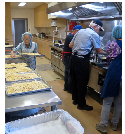
To kitchen for frying