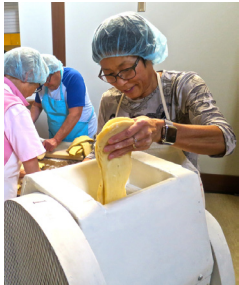
Into first press...

Mein-making Saturday began at 8 am Nov. 16, with a great turnout of members and Dharma friends. The job was completed by mid-afternoon, thanks to outstanding efforts. Thanks to everyone who worked so diligently to make valued mein noodles preparatory to the Bodhi Bake Sale on Nov. 30. Thanks too to all those who prepared inviting and delicious coffee break and lunch. Wonderful job of cleaning up, too.