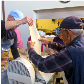
Second press, and...