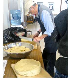
Slice dough cake