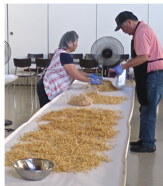
Dry and cool