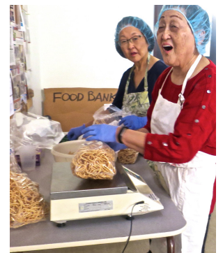
Bag and weigh