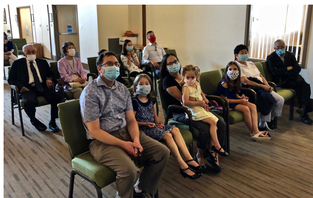
Families observe Hatsubon