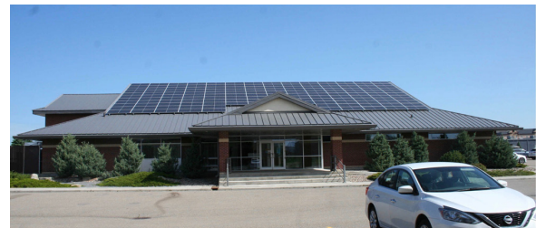
Solar panels were installed atop the temple southside roof during July. The addition will make the temple more energy efficient.