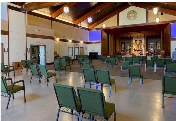
A recent photo inside BTSA with new seating arrangements to accomodat social distancing.

The AV committee is continuing to be very active and helping in producing content for our Pod cast, facebook page and making services available on our You tube Channel. Please visit our You Tube page to look at the content. Thanks to the efforts of Ross Jacobs we now have the ability to live stream and record our services including funeral services.