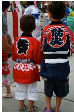
Bon Odori in July

New Onenju from Japan are available. ($15 for male onenju. $18 and $20 for female onenju)