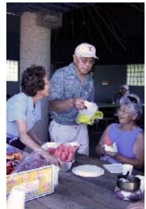
BTSA Picnic in June