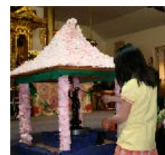
Pouring sweet tea over a statuette of the baby Buddha.

The children always look forward to Hanamatsuri celebrations in April, commemorating the birth of the Buddha. This year there will be a short performance that all youth in attendance are invited to join. There will be an activity related to spring and perhaps the weather will cooperate and children can enjoy our own Lumbini garden and playground. Last but not least, a birthday cake for all to enjoy.